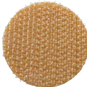
Adhesive-backed hook and loop tape