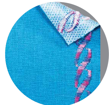
Embroidery with self-adhesive stabilizer